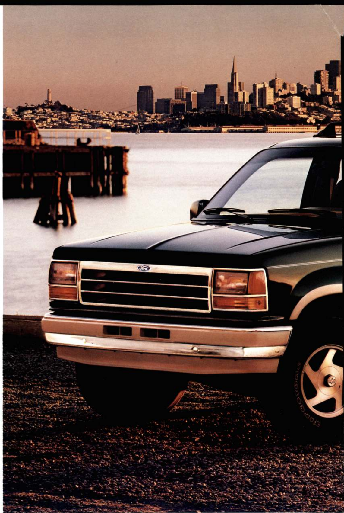
The top-of-the-line Eddie Bauer Explorer 2-Door in unique two-tone Hunter Green Clearcoat Metallic and Light Sandalwood. Some equipment shown on these pages is optional.

Choose the youthful Explorer Sport (pages 18-19); or, featured here, the luxury-sport Eddie Bauer Explorer or the fun-tough Explorer XL. All share the same high standards of design and engineering performance, and quality.