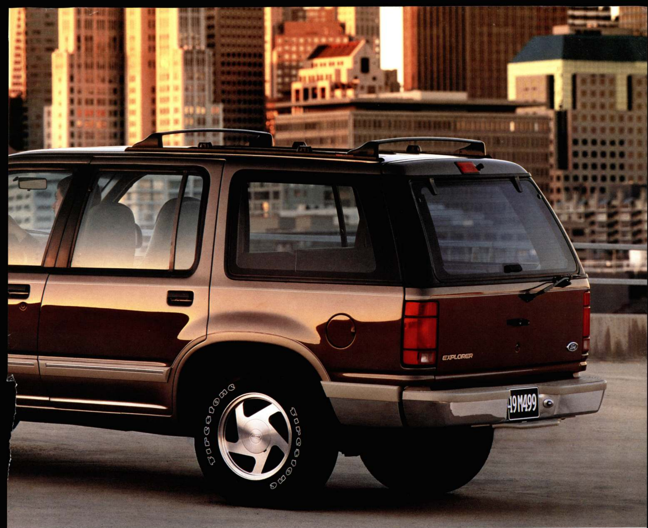
Eddie Bauer Explorer 4-Door in unique two-tone Sandalwood Clearcoat Metallic and Light Sandal- wood. Some equipment shown on these pages is optional.