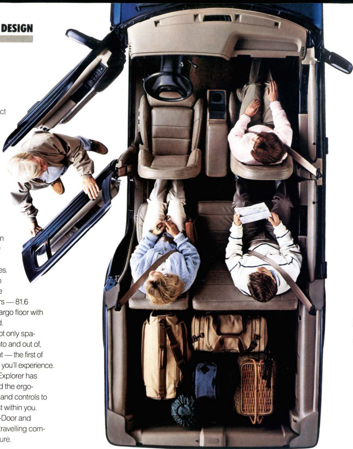
The Explorer 4-Door offers a spacious interior and a low step-in height for easy entry and exit.

Drive the new Explorer 4-Door and open new doors to greater travelling comfort, enjoyment, and adventure.