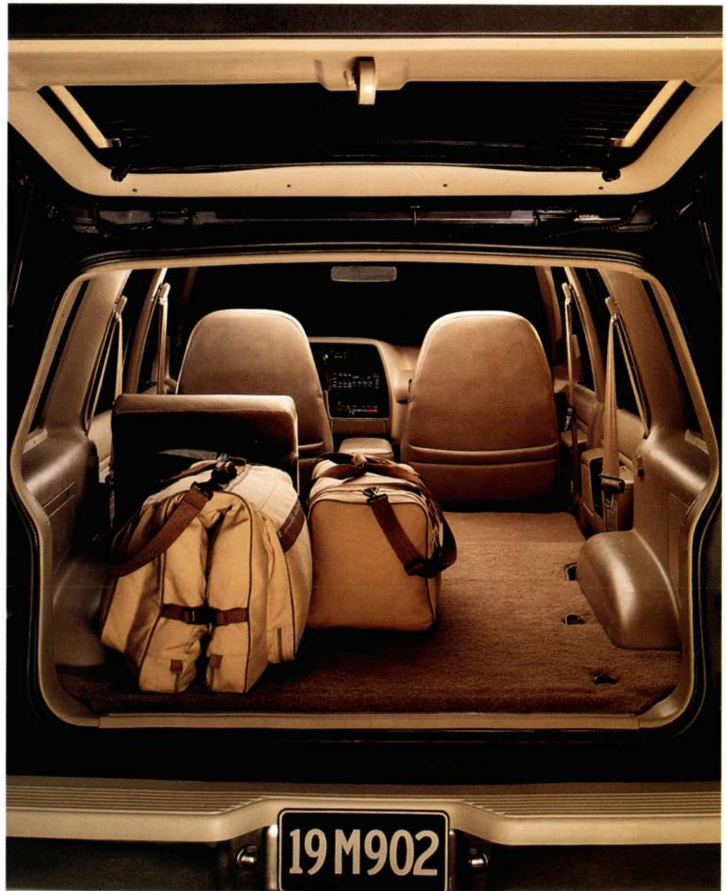
The roomy Explorer 4-Door features a versatile 60/40 rear split bench seat.

The new Explorer 4-Door. Here is a line of V-6-powered 4x2 and 4x4 vehicles with a combination of style, performance, space and comfort that gives the term "compact utility" a new dimension.