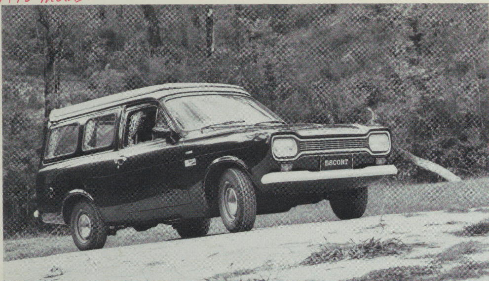
Built strong to take Australia in its stride.