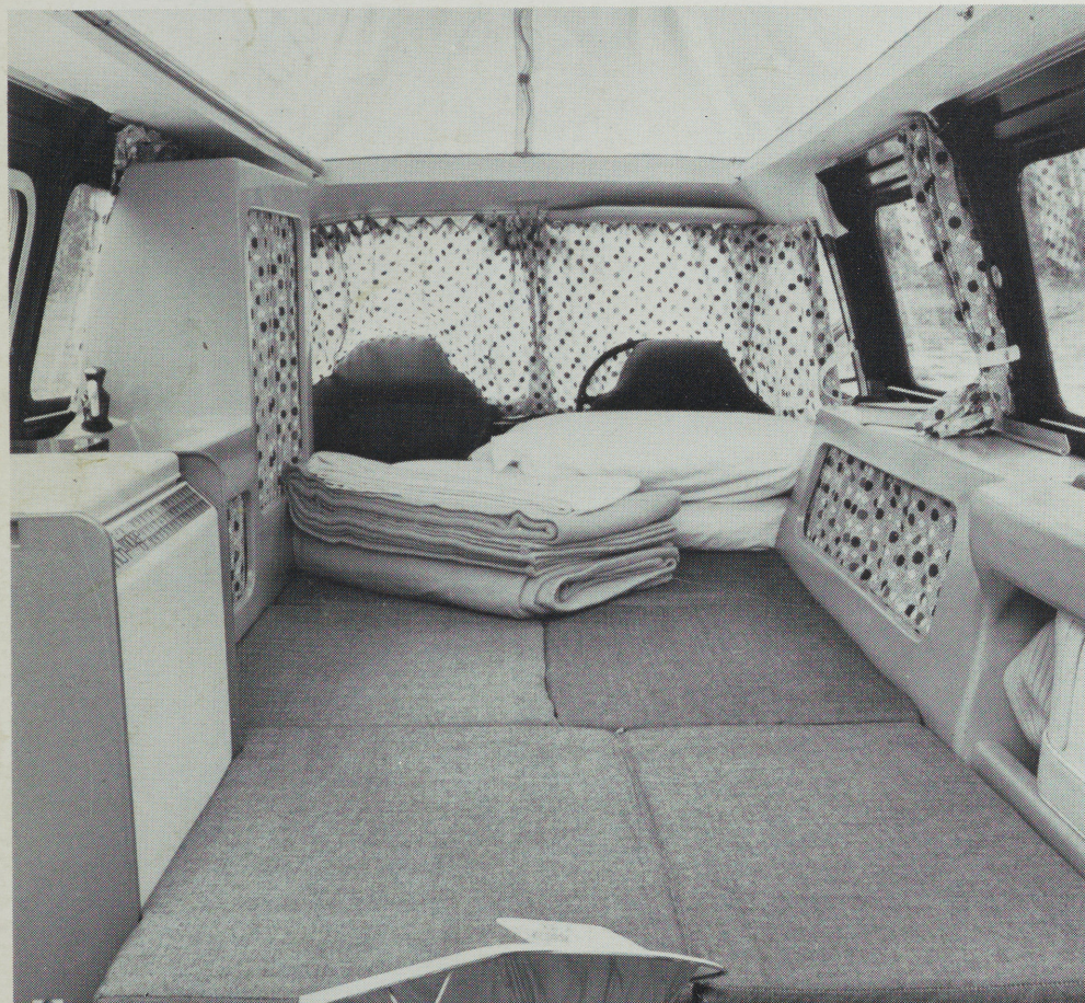
The master bedroom.