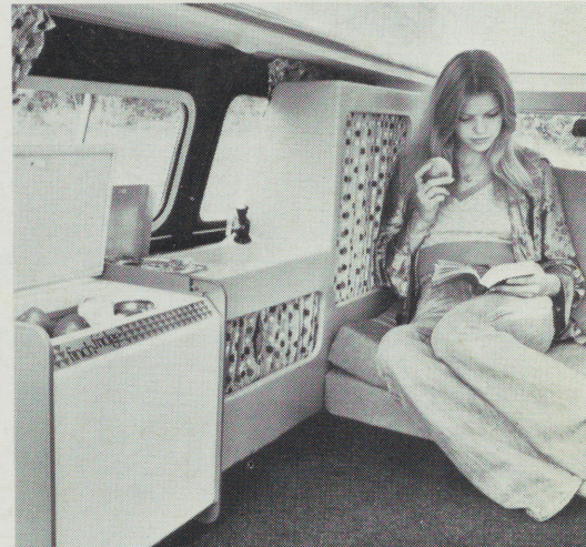
The family room.